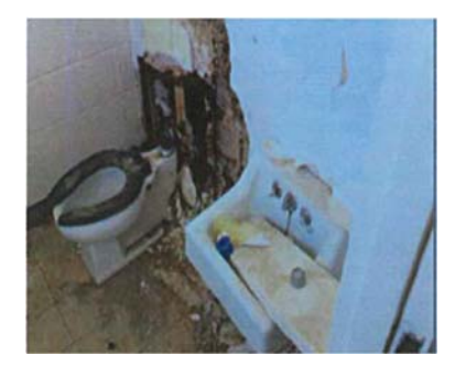
Los Lunas Campus Cottage Bathroom

GSD requested $10.6 million for statewide deficiency, preventative, and emergency repairs, including $4.7 million for fire protection, $3.3 million for building shells and roofs, and $1 million for other emergencies.