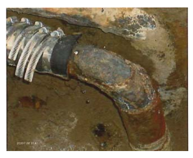
Local FY20 Requests Top 5 Priorities by Category (estimated project costs)