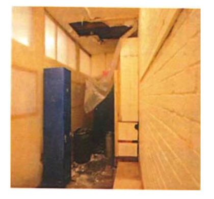
NMBHI La Planta Building

GSD requested $10.6 million for statewide deficiency, preventative, and emergency repairs, including $4.7 million for fire protection, $3.3 million for building shells and roofs, and $1 million for other emergencies.